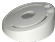
DS-1259ZJ Inclined Base Mounting Bracket