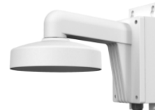
DS-1272ZJ-110 Wall Mounting Bracket