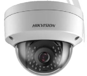
Non 2.8 mm Fixed Focal Lens