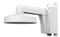
DS-1272ZJ-110B Wall Mounting Bracket