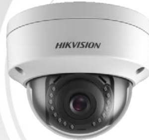
2.8 mm Fixed Focal Lens